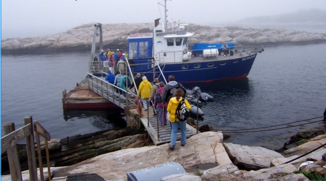
Appledore Island continued on page 3

The Gulf Challenger ship plied through a thick fog on the Atlantic Ocean on June 13 to Appledore Island with 30 persons on an OLLI trip to learn about the nature and history of the Isles of Shoals.