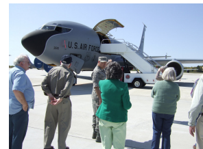
Mid-Air Refueling class members visit the plane that does the refueling.