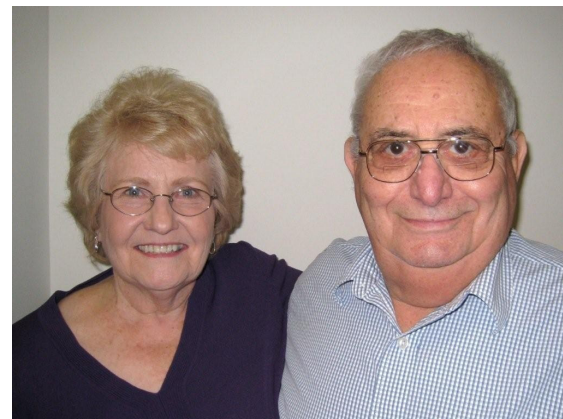
Love Is in the Air at OLLI.